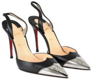
13 SEK 2 500 | € 220