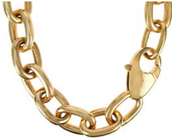
43 SEK 2 400 | € 210