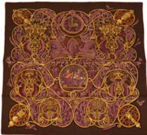
16 SEK 2 400 | € 210

VERSACE, SANDALETTE, Virtus Slip On Sandals, black leather, gold-tone hardware, size 38, heel 9 cm, dustbag, original box, slightly worn soles.