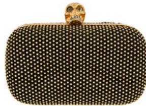
65 SEK 4 500 | € 390

CHANEL, BAG, Jumbo Double Flap 30, ivory, green, purple, burgundy quilted tweed, silver-tone hardware, burgundy leather, 30x20x10 cm, hologram-marked 22259699, year 2016-2017.