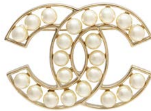
47 SEK 2 800 | € 240

CHANEL, BAG, Jumbo Double Flap Bag, black lambskin, silver-tone hardware, 30x19,5x10 cm, hologram-marked 27578219, year 2019, certificate, receipt copy, cleaning cloth, dustbag, original box.