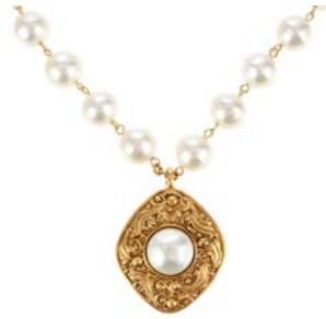
62 SEK 9 000 | € 780

CHANEL, BACKPACK, Rare Limited Edition Fur Backpack, green calfskin, gold-tone hardware, 22x24x12 cm, adjustable shoulder strap, hologram-marked 26041825, year 2019, dustbag.