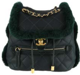
61 SEK 49 000 | € 4 220