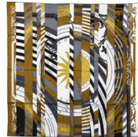
48 SEK 3 500 | € 300

CHANEL, BROOCH, Faux Pearl CC Brooch, white imitation pearls, gold-tone metal, 5,5x4 cm, weight 21,4 g, marked A18V, year 2018.