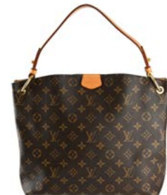
18 SEK 8 800 | € 760

CHLOÉ, BAG, Faye Bag, brown leather, suede, gold-tone hardware, 32x25x2 cm, removable and adjustable shoulder strap, certificate, dustbag.