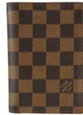
45 SEK 1 900 | € 160

VERSACE, BRACELET, Medusa Cuff Bracelet, gold-tone metal, diameter 6 cm, weight 78 g, width 4,5 cm, certificate, original box.