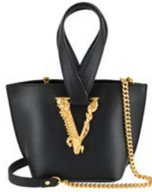
14 SEK 6 500 | € 560

CHRISTIAN LOUBOUTIN, PUMPS, Calamijane Cap Toe Slingback, black leather, silver-tone hardware, size 38½, heel 10,5 cm, resoled, extra heel, original box.