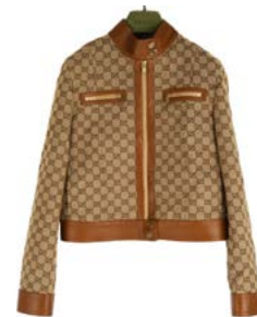
66 SEK 22 500 | € 1 940

ALEXANDER MCQUEEN, CLUTCH, black suede, leather, gold-tone hardware, studs, Swarovski crystals, 16x9x5 cm, removable and adjustable shoulder strap.