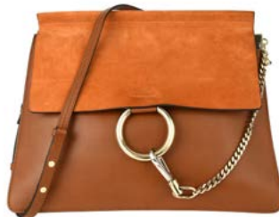
17 SEK 10 000 | € 860

HERMÈS, SCARF, La Charmante aux Animaux, Annie Faivre, 100% silk, 90x90 cm, brown, orange, gold, pink, purple, original box.