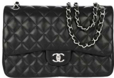
46 SEK 68 000 | € 5 860

LOUIS VUITTON, PASSPORT CASE, Passeport Cover, Damier Ebene Canvas, 10x14x2,5 cm, marked CA4048, year 2008, receipt copy, dustbag.