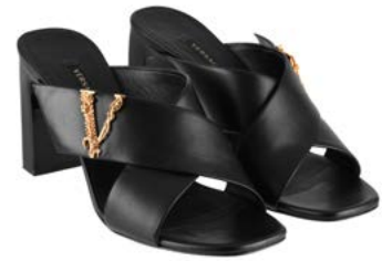
15 SEK 2 500 | € 220

VERSACE, BAG, Virtus Bucket Bag, black leather, gold-tone hardware, 14x14x8 cm, removable shoulder strap, dustbag.