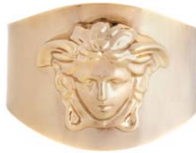
44 SEK 1 300 | € 110

ROBERTO CAVALLI, NECKLACE, gold-tone metal, length 62, width 4 cm, weight 427 g, made in Italy, dustbag.