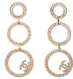
63 SEK 2 500 | € 220

CHANEL, NECKLACE, Vintage Baroque Pearl Lozenge Pendant Necklace, white imitation pearls, gold-plated metal, length 40-43 cm, height pendant 5 cm, weight 94 g, year ca 1970, receipt copy on service by Chanel, every pearl is replaced, original box. paper bag.